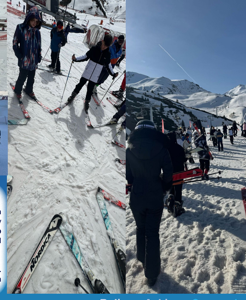
Believe. Achieve. Succeed.

Huge thanks to everyone who made this journey so special. You all crushed it on the slopes and brought your A-game in every moment!