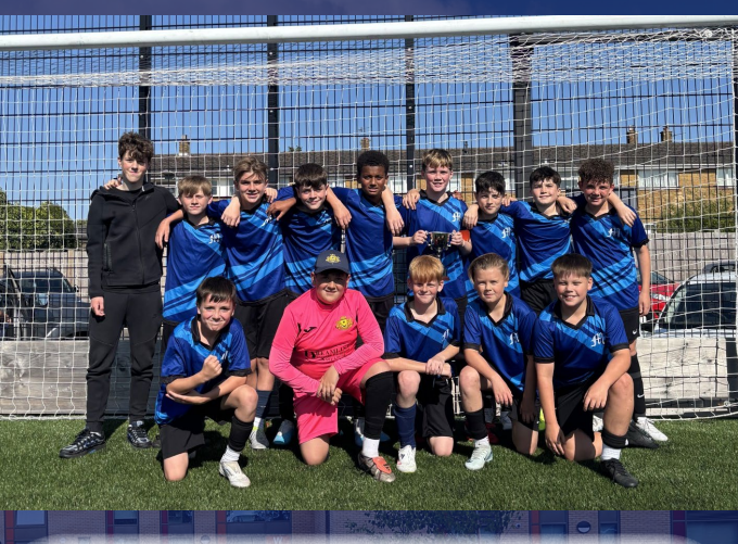
Year 7 Football Team End the Season with a Fantastic 5–2 Win v Priory!

If these items of clothing are not returned to their rightful owner by the end of each half-term, they will be given to charity or the Pre-Loved Uniform Shop.